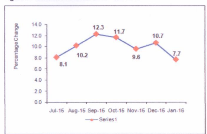
Figure 1: Trend in PPI-M Jul 2015 - Jan 2016

The Producer prices for manufactured goods increased by 7.7% for the year ending January 2016 compared with the year ended January 2015. Similarly, for the year ending December 2015 the producer prices for manufactured goods registered an increase in prices of 10.7% compared to the year ended December 2014.